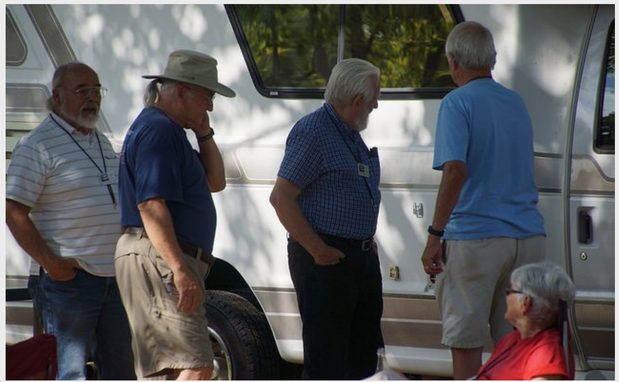
The KOA is located right next to the Cock of the Walk restaurant, so we gathered there for the annual club dinner. Kind of a chaotic atmosphere, but the food was great!